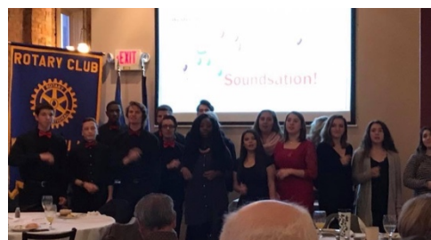
Westerville South Soundsations